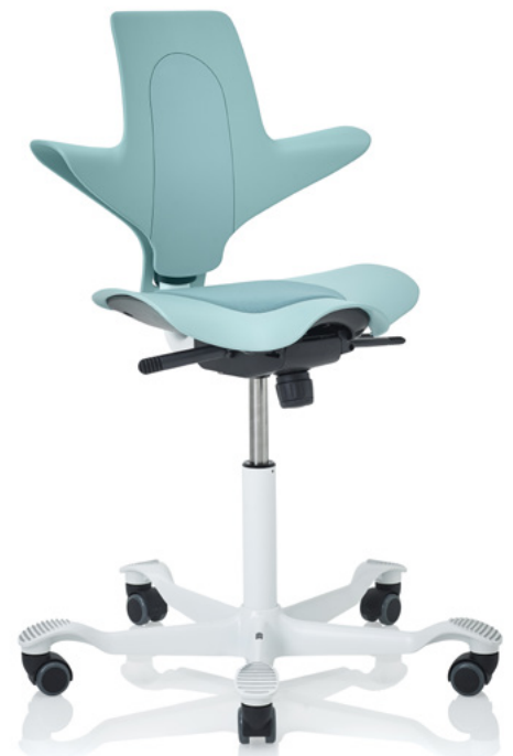
Design: Peter Opsvik. Patent- and design protected.