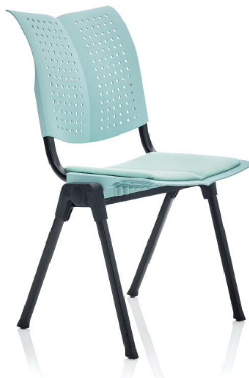
Design: Peter Opsvik. Patent- and design protected.