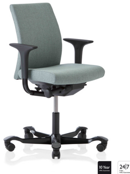
Design: Peter Opsvik. Patent- and design protected.