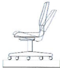
Figure 4a - Type I - Tilting Chair

The chair was tested as Type I/III due to the lockable tilt mechanism