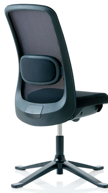
Design: Frost Produkt AS, Powerdesign AS and Flokk Design Team Patent- and design protected