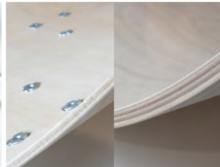
Seat base in moulded beech. Multiple layers of veneer guarantee a long service life. Pre-drilled holes in the seat allow easy attachment of the four different frames.