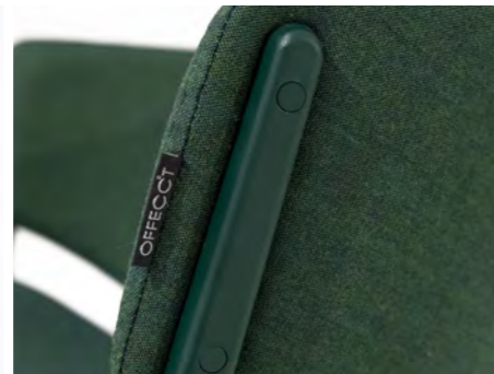
Coloured caps conceal the fastenings.