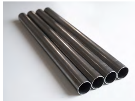
Legs for the Phoenix four-leg frame in tubular steel.