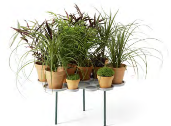
Green Pads, 2011