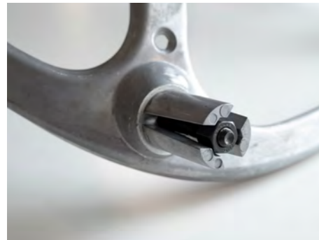
The leg attachment allows easy assembly and disassembly. Developed by Offecct R&D.