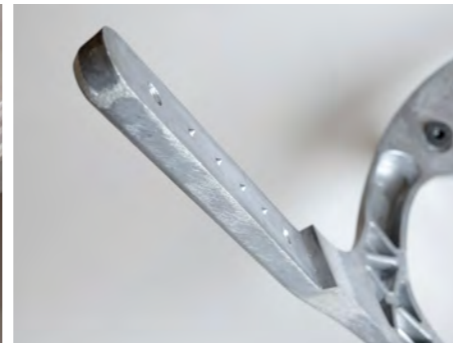
Rods are embedded in the frame to ensure secure attachment of the back.