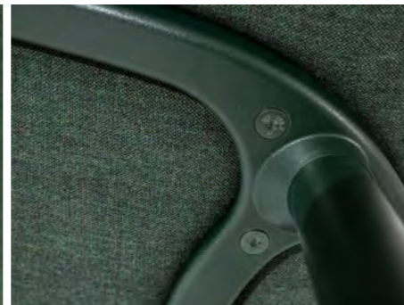
Easily-accessible attachment point under the seat simplifies attachment and removal of the frame.

“I always look at Phoenix as a very good cake, where there was a lot of very interesting ingredients. And me and Offecct were good chefs, to balance the ingredients to make the recipe for this cake.”