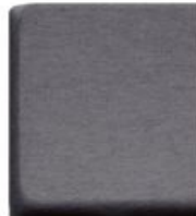
Soundwave Pix large