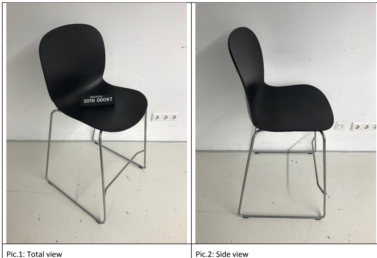
Pic.1: Total view