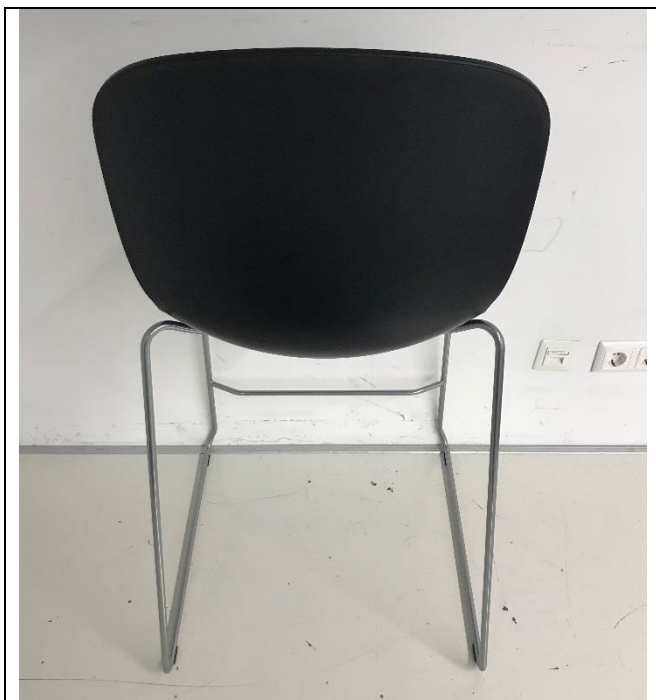
Pic.3: Back view