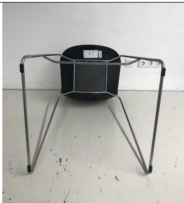
Pic.4: Bottom view