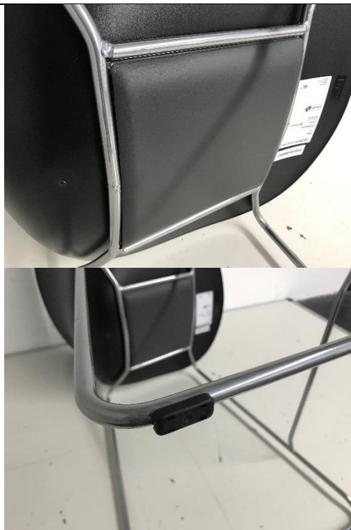
Pic.6: Seat base and leg glider