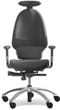
RH EXTEND 120

RH Extend 100 and 120 follows your slightest movement – regardless of working position. The chair maintains its basic settings regardless of whether you lean forwards or backwards or whether you lock or release the tilt mechanism – a practical and simple alternative when several people use the same chair.