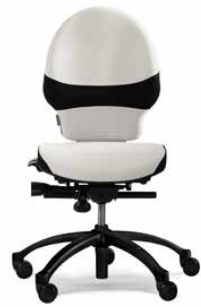
RH EXTEND 100

RH Extend 100 and 120 follows your slightest movement – regardless of working position. The chair maintains its basic settings regardless of whether you lean forwards or backwards or whether you lock or release the tilt mechanism – a practical and simple alternative when several people use the same chair.