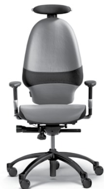
RH EXTEND 220

Same functions as RH Extend 120 although with a lower backrest.