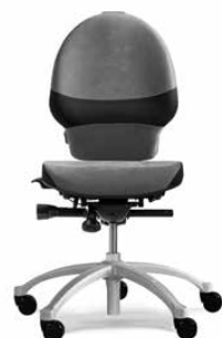
RH EXTEND 200

RH Extend 200 and 220 has in addition to the features on the 100 series a separate back angle adjustment. The back of the chair can be angled precisely according to individual preference, making this a uniquely adjustable and user-friendly chair.