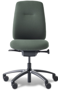
RH LOGIC 200 ELITE