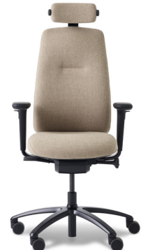
RH LOGIC 220 ELITE