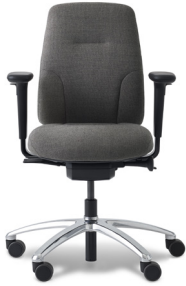
RH LOGIC 200