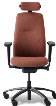
RH LOGIC 220