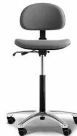
RH SUPPORT 4521

Support chair with a round seat pad. Also available without backrest. As standard, the chair is equipped with a base in black aluminium and glides.