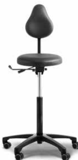
RH SUPPORT 4545

Support stool with "Limpan" seat. Also available without backrest. As standard, the chair is equipped with a base in black aluminium and glides.