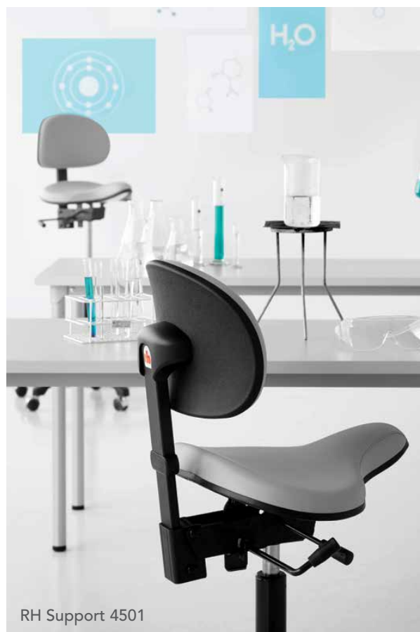
RH Support 4501