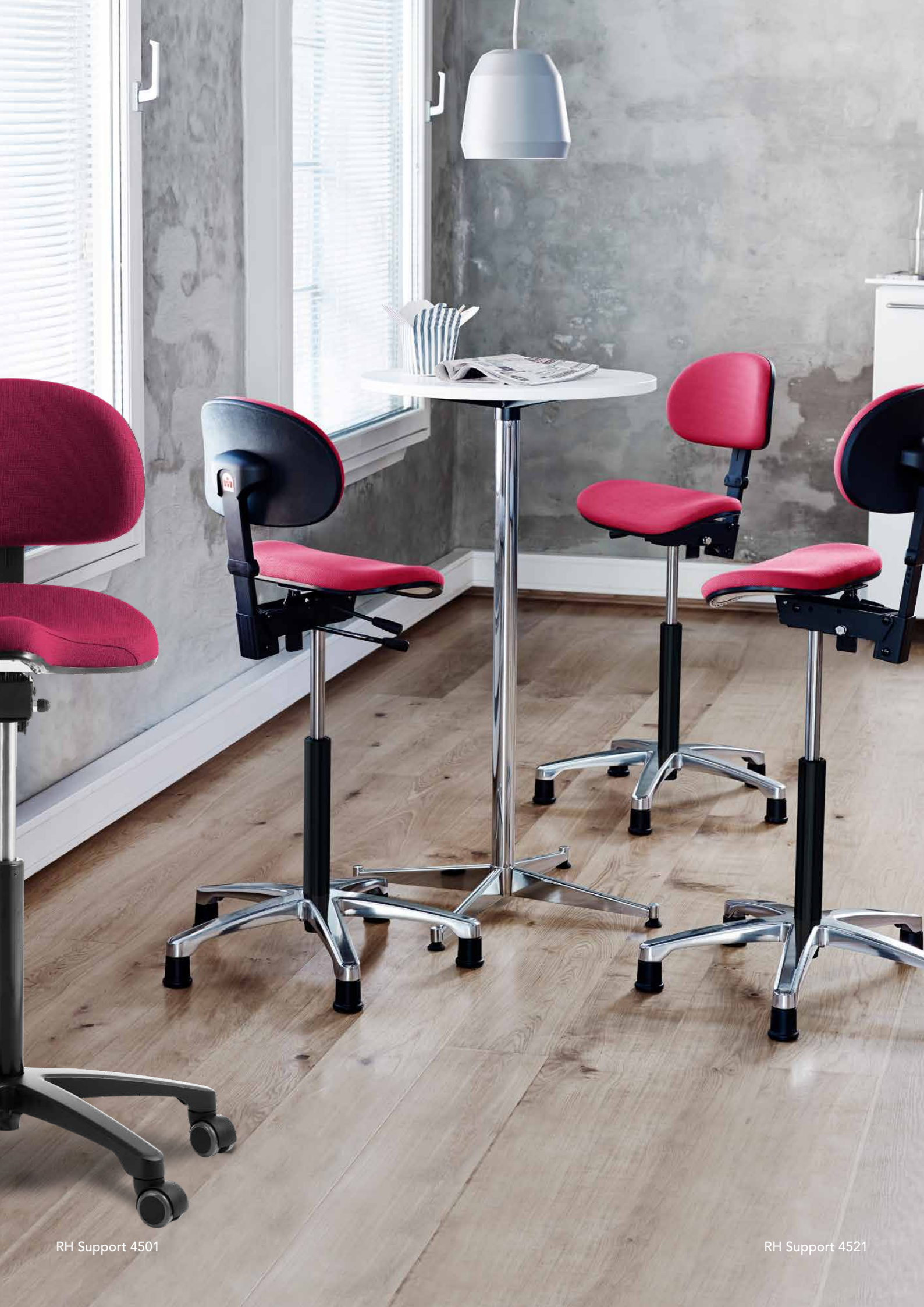
RH Support 4501