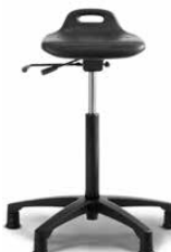
RH SUPPORT 4532

Can be used as a sit-stand support stool or for chest support. The narrow chest support takes the weight of the body and gives great freedom of movement for the arms. As standard, the chair is equipped with a base in black aluminium and glides.