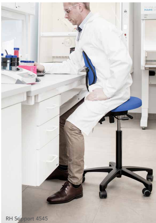
RH Support 4545