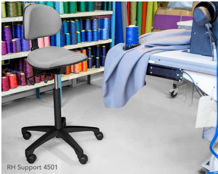
RH Support 4501