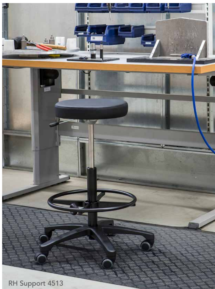
RH Support 4513