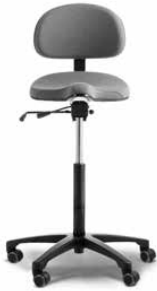
RH SUPPORT 4501

Support chair with saddle-shaped seat. Also available without backrest. As standard, the chair is equipped with a base in black aluminium and glides.