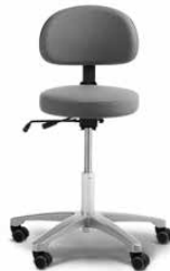
RH SUPPORT 4511

Support chair with saddle-shaped seat. Also available without backrest. As standard, the chair is equipped with a base in black aluminium and glides.